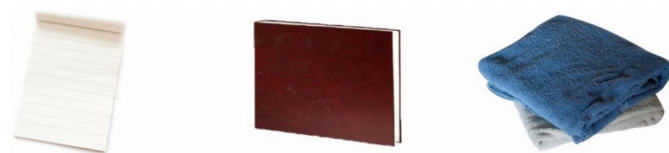
Figure 2 Examples of neutral pictures from food-pics: an image database for experimental research on eating and appetite.

Participants will be asked to watch the images and to rate their current emotion on scales of arousal, dominance and valence, for which the SAM will be used. 33 In addition, neutral objects will be displayed to provide control images (eg, towels and books; see figure 2 for examples of neutral images), which will be taken from an existing and validated database. 45 A break will be included halfway through the stimulus presentation to assess participants' emotional status and to prevent dissociations. 46 Image presentation and SAM rating screens will be pseudorandomised across all categories. Medical professionals will be monitoring the participants to prevent overtraining and to intervene if necessary. In total, 90 images will be shown (45 EPSI/45 neutral), each for 500 ms, followed by the SAM evaluation (see figure 3 for the study design). At the end of the experiment, participants