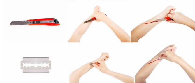
Figure 1 Examples from EPSI for the three categories of objects and scenes for NSSI. From first in a row: objects that are frequently used for NSSI by patients with BPD (SIO), scenic presentation of usage shortly before the injury and scenic presentation during the usage of SIO. BPD, Borderline personality disorder; EPSI, emotional picture set of self-injury; NSSI, non-suicidal self-injury; SIO, self-injury objects.