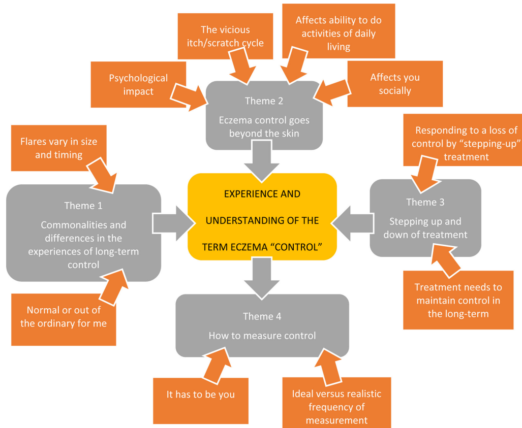
Figure 2 Mapping of the thematic framework.

If I catch a minor flare quickly enough I can sometimes control the irritation before it get completely out of control to what I call a meltdown. (Participant 5, group 1, female, aged 20 years)