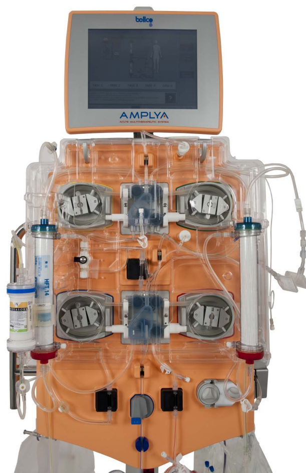
Figure 1 AMPLYA system from Bellco Societa unipersonales a r.l. The resin cartridge and plasma filter are in position and ready for use. The copyright holder (Bellco) has approved the usage of this figure.

CPFA was first used in the late 1990s with subsequent publications of several small observational clinical reports and case studies. 20–26 A few years ago, a large randomised multicentre controlled trial was performed by a group of Italian intensive care physicians, GiViTI, but the trial was stopped for futility. 27 Factors leading to early stopping were extensively analysed by the investigators and focused primarily on technical problems and the inability to achieve an appropriate dose of treated