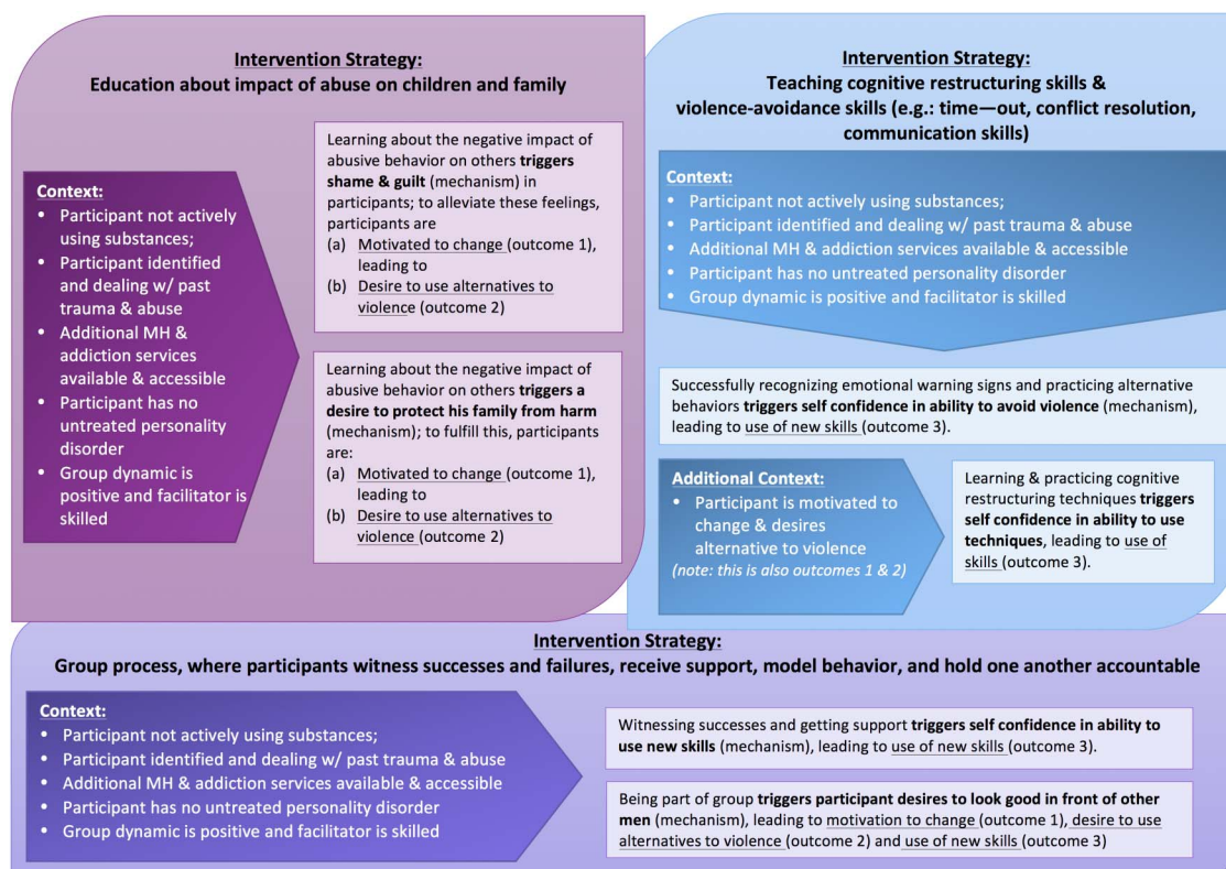
Figure 3 Sample context-mechanism-outcome configurations from the preliminary rough theory of batterer intervention treatment programmes.

that multiple mechanisms are often at work within each strategy, and that sometimes change has to happen in a particular order. For example, one ‘education strategy’