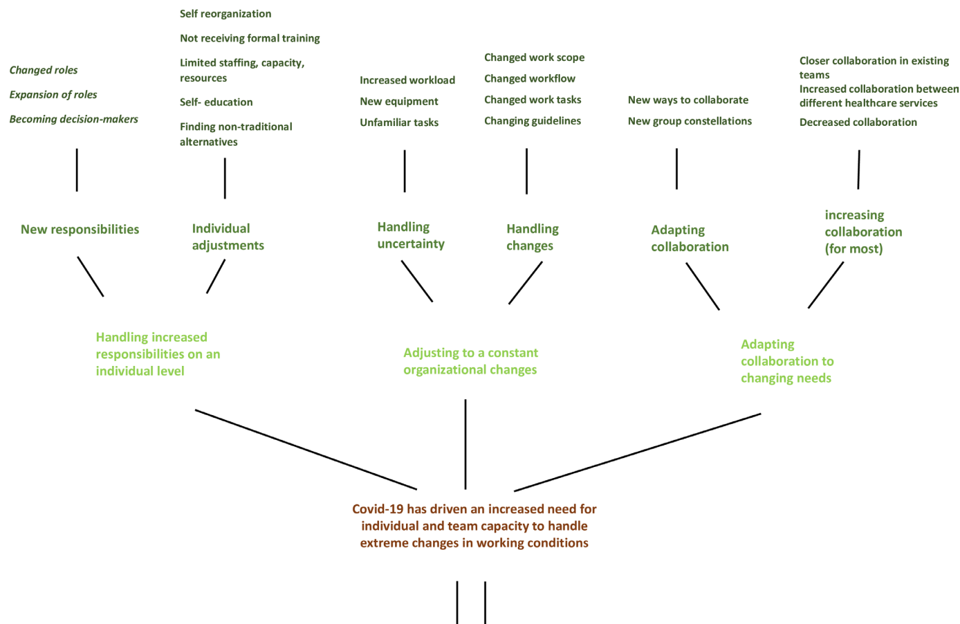
Figure 1 Example of analysis theme 1, steps 1–3.

as well as creating new collaborations, to handle changing needs.