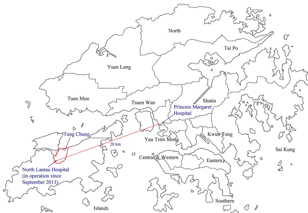
Figure 1 Map of Hong Kong showing the location of Tung Chung and location of available healthcare services for Tung Chung residents. According to the 2011 census, around 78 000 residents were living in Tung Chung new town. To satisfy the shelter demands, three public housing estates, Fu Tung Estate, Yat Tung (I) Estate and Yat Tung (II) Estate, have been established to provide more than 13 000 residential units to Tung Chung residents. However, since it is located on the north-western coast of Lantau Island in Hong Kong, a minimum of 45 minutes travelling time using the Mass Transit Railway (MTR) metro system is required for residents to travel to Hong Kong's business centre in Central, other commercial centres or the nearest regional hospital with full medical services (the Princess Margaret Hospital). (The map was drawn using the software R V.3.1.1.).

recruited from various Hong Kong subdistricts for comparison. Control families will not be invited to join our Health Empowerment Programme; nevertheless, a comprehensive health assessment will be provided at the beginning and end of the programme for collecting various health variables.