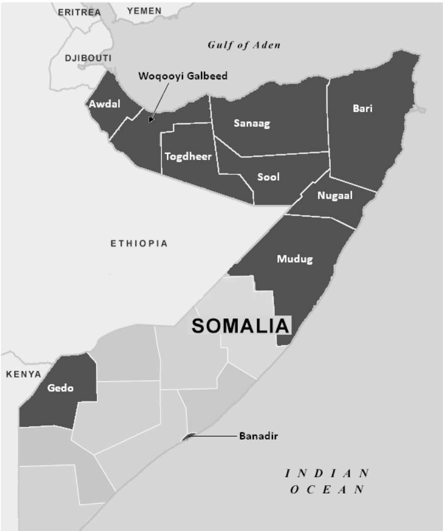
Figure 1. Participating regions of Somalia.

Of the 14 facilities that responded to the survey 5 were provincial hospitals, 5 were private/mission/NGO hospitals, 3 were general hospitals and 1 was a health center. Each facility reported having at least 1 operating theatre, with a maximum of between 11 and 20 operating theatres. The populations served by each facility ranged from 100,000 to 1,000,000 people, with the average of the reporting facilities being 331,250 people.