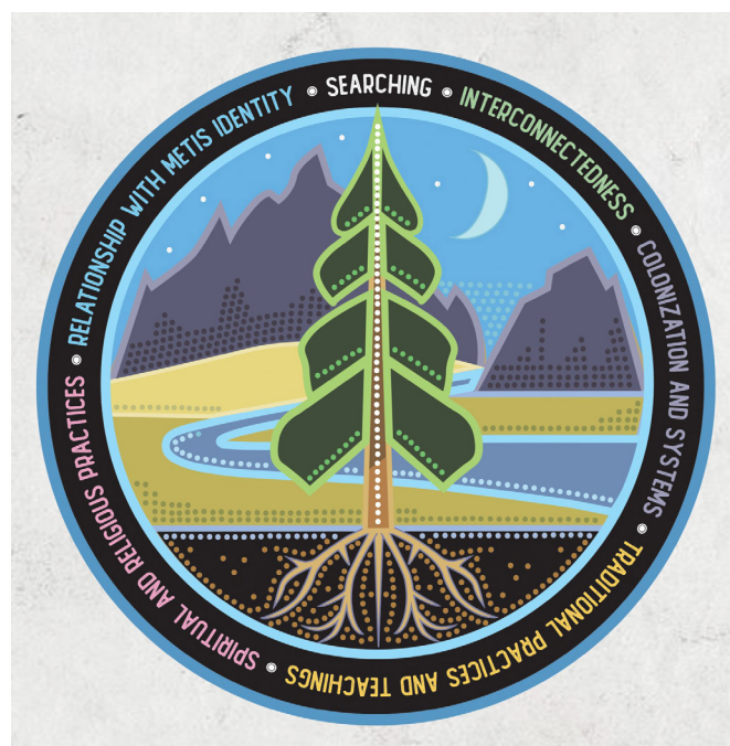
Figure 1 Health, spirituality and well-being in the Métis Nation of Alberta Region 3.

Your health and well-being are definitely connected; if you are not a healthy person, there's a good chance that things in your life are harder to do or to live with. As for the spirit, I don't believe in spirits or spirituality. I believe we are all of the universe, you are made of space dust you go back to space dust. And I suppose I find comfort in that. (Participant 74)