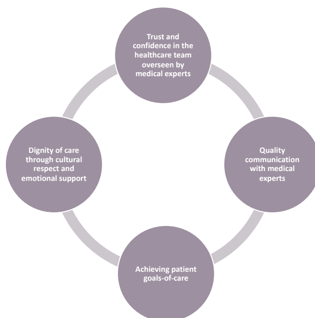
Figure 1 Key themes influencing perceptions around the quality and experience of end-of-life care.

members. This was particularly experienced by family members of patients who were dealing with serious traumatic injuries or frailty and had short stays in hospital (cases 3–5). Quality communication between family