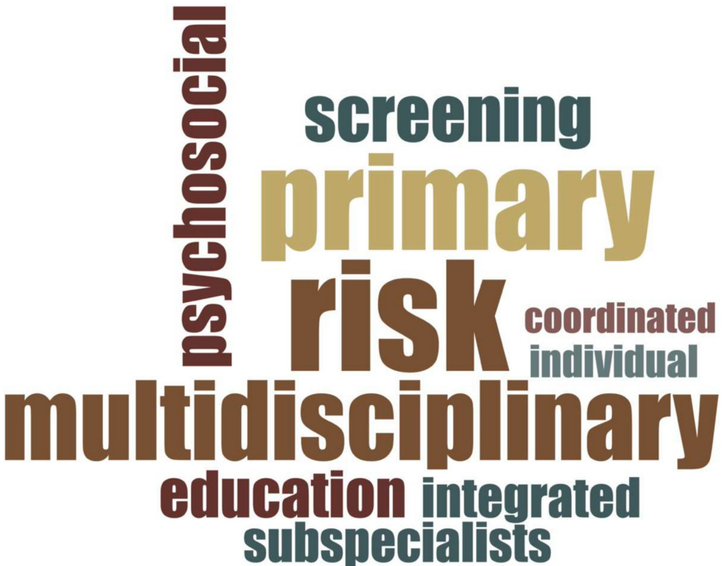
Figure 2 Word cloud of top 10 most frequently used words of the care coordination models.

were involved in one childhood cancer survivor’s care, matching each survivor to the appropriate services in an efficient manner was a commonly described challenge. Therefore, introducing a dedicated role responsible for coordinating various services and patient navigation was a feature of the models. The navigator or coordinator typically played the role of ‘link’, connecting childhood cancer survivors and their families to various healthcare