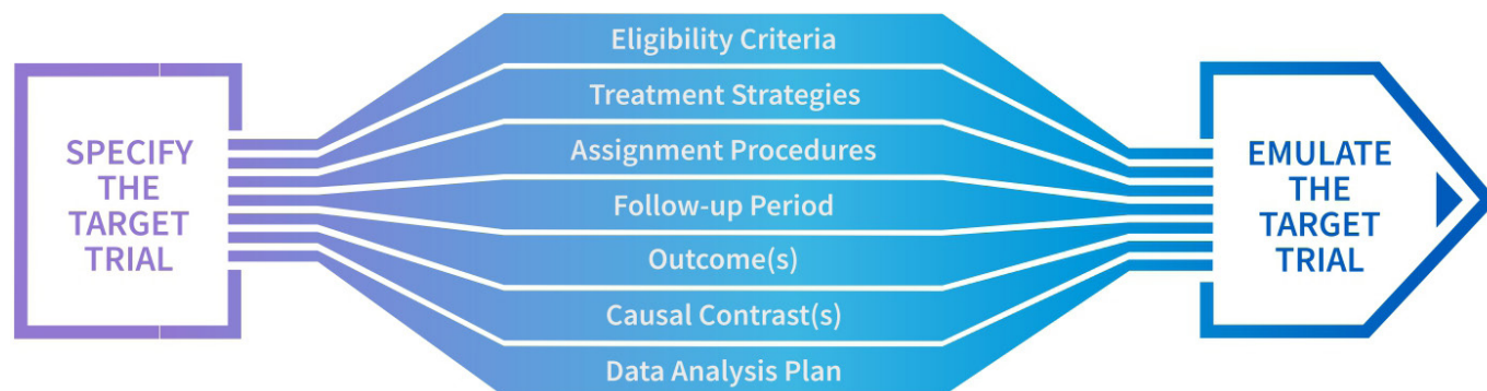
Figure 1 Elements relevant to both the specification and emulation of the target trial described by Hernán and Robins. 3

Application of the target trial framework requires the complete specification of the target trial protocol and its emulation (figure 1). 3 Hernán and Robins 3 provide a template for specifying a target trial and its emulation; however, there is currently no detailed guidance on reporting a study designed to emulate a target trial. Incomplete reporting of these studies limits the ability of clinicians, researchers, patients and other decision-makers to appraise and synthesise findings or interpret them to inform clinical and public health practice and policy. A reporting guideline that expands on the initial target trial emulation template 3 is needed to provide authors with comprehensive recommendations on how to completely and transparently report a study emulating a target trial.